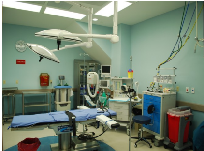
One of three ORs at a medical facility in Englewood that QMS helped design and build.