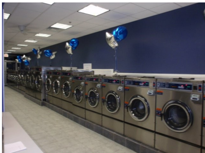
A row of washers at a Laundromat in New Milford where QMS was responsible for all the plumbing and HVAC.