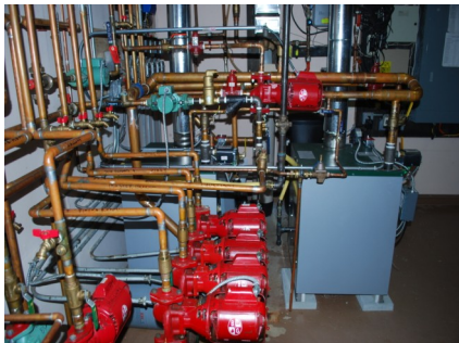
A residential dual boiler system in Cresskill that QMS retrofitted and built.